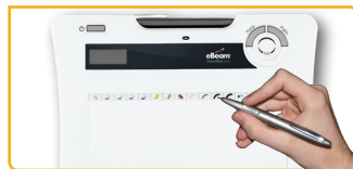
eBeam Inscribe 200e Wireless Tablet