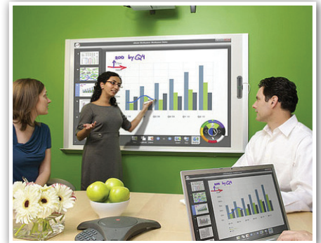
Glass whiteboard image depicted