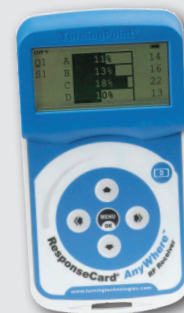
ResponseCard AnyWhere Receiver