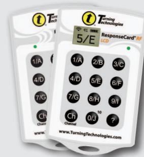
RF & RF LCD ResponseCard Keypads