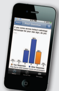
Smartphone using ResponseWare