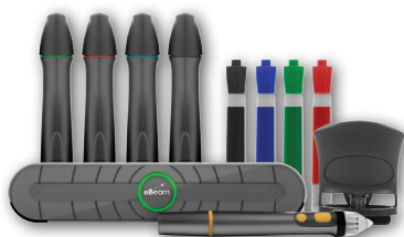
eBeam Edge for Business Complete