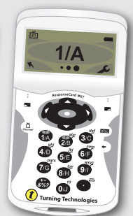
ResponseCard NXT Keypad